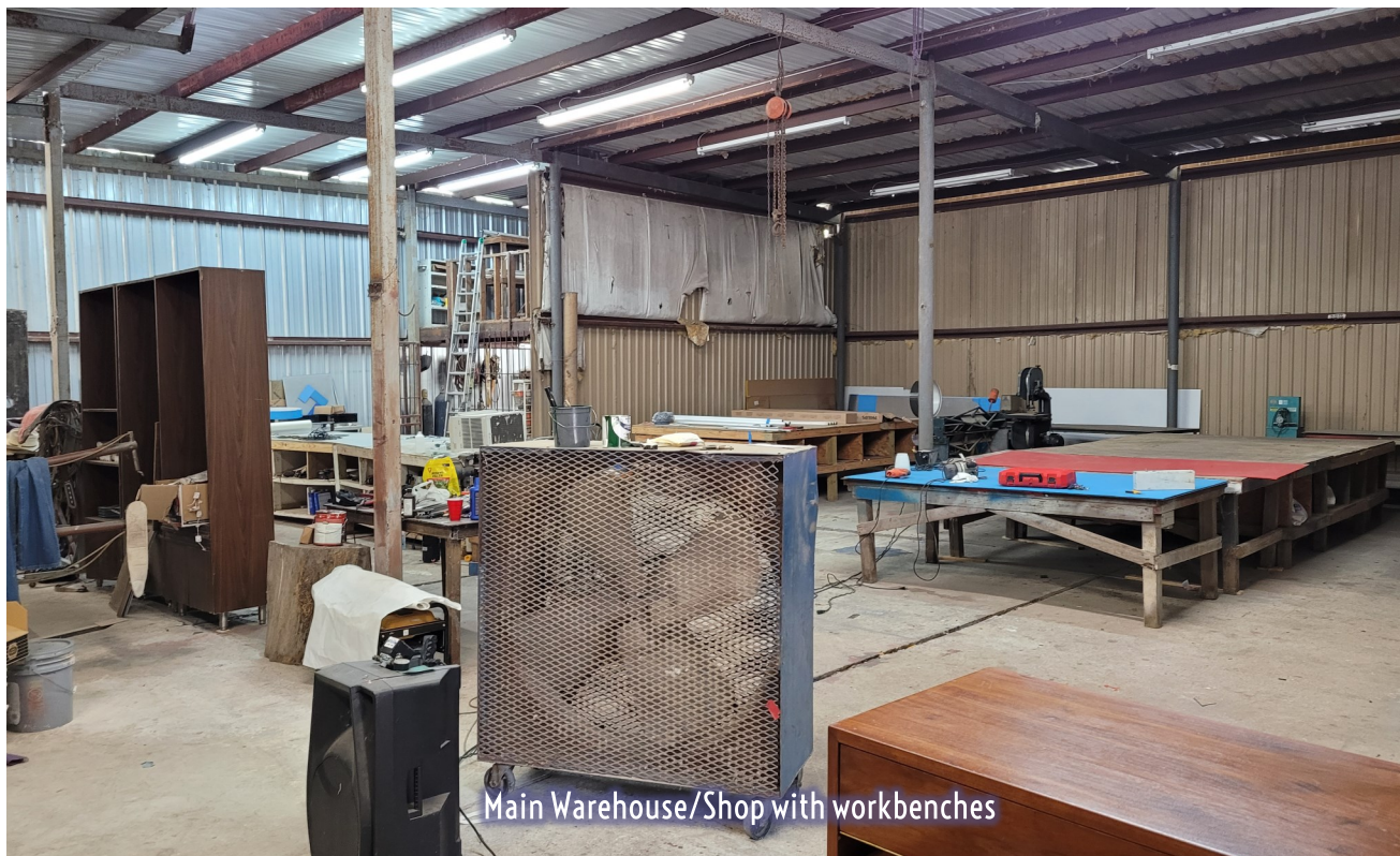
Main Warehouse/Shop with workbenches