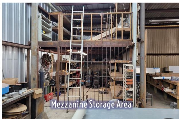
Mezzanine Storage Area