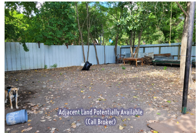
Adjacent Land Potentially Available (Call Broker)