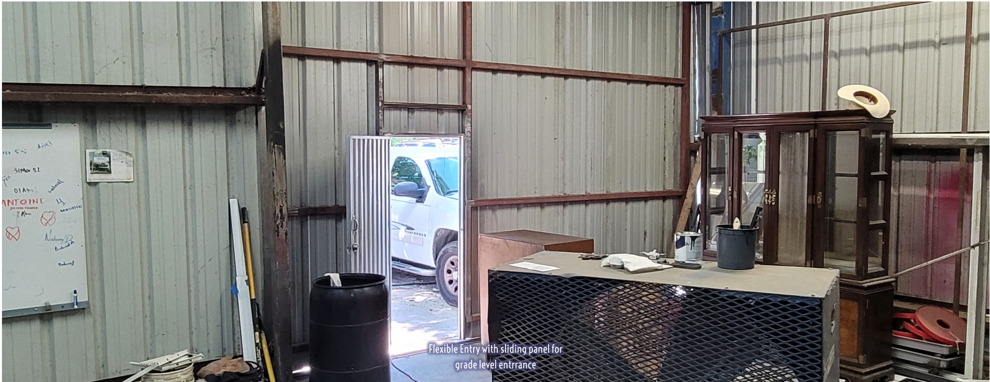
Flexible Entry with sliding panel for grade level entrance