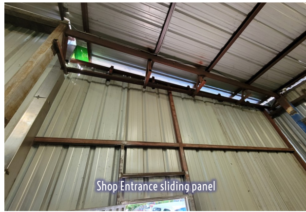
Shop Entrance sliding panel